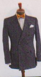
New Threads An alteration on Savile Row p84

May 9 — May 15, 2011 Bloomberg Businessweek